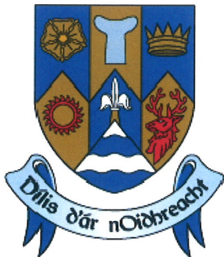
Comhairle Contae an Chláir Clare County Council