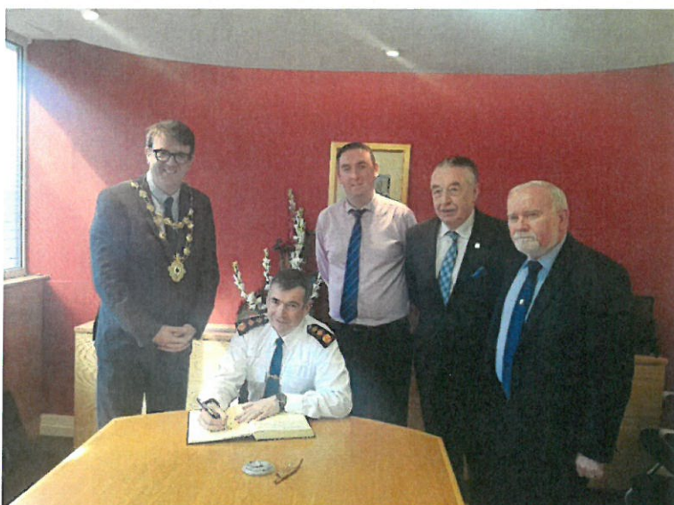
Commissioner Harris signing the visitors book after attending the Galway City JPC meeting on 25 th March 2019