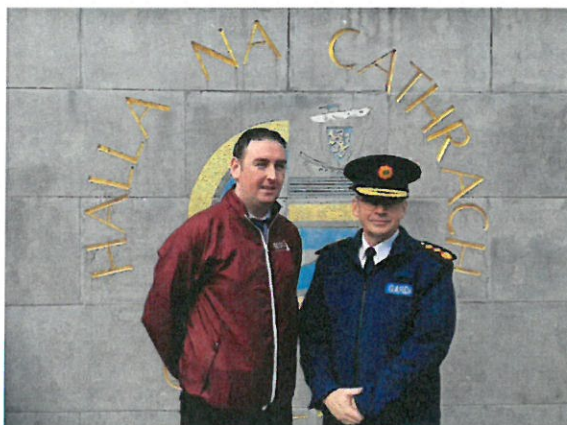
Commissioner Harris outside City Hall with the former Chairperson of the Galway City JPC meeting on 25 th March 2019