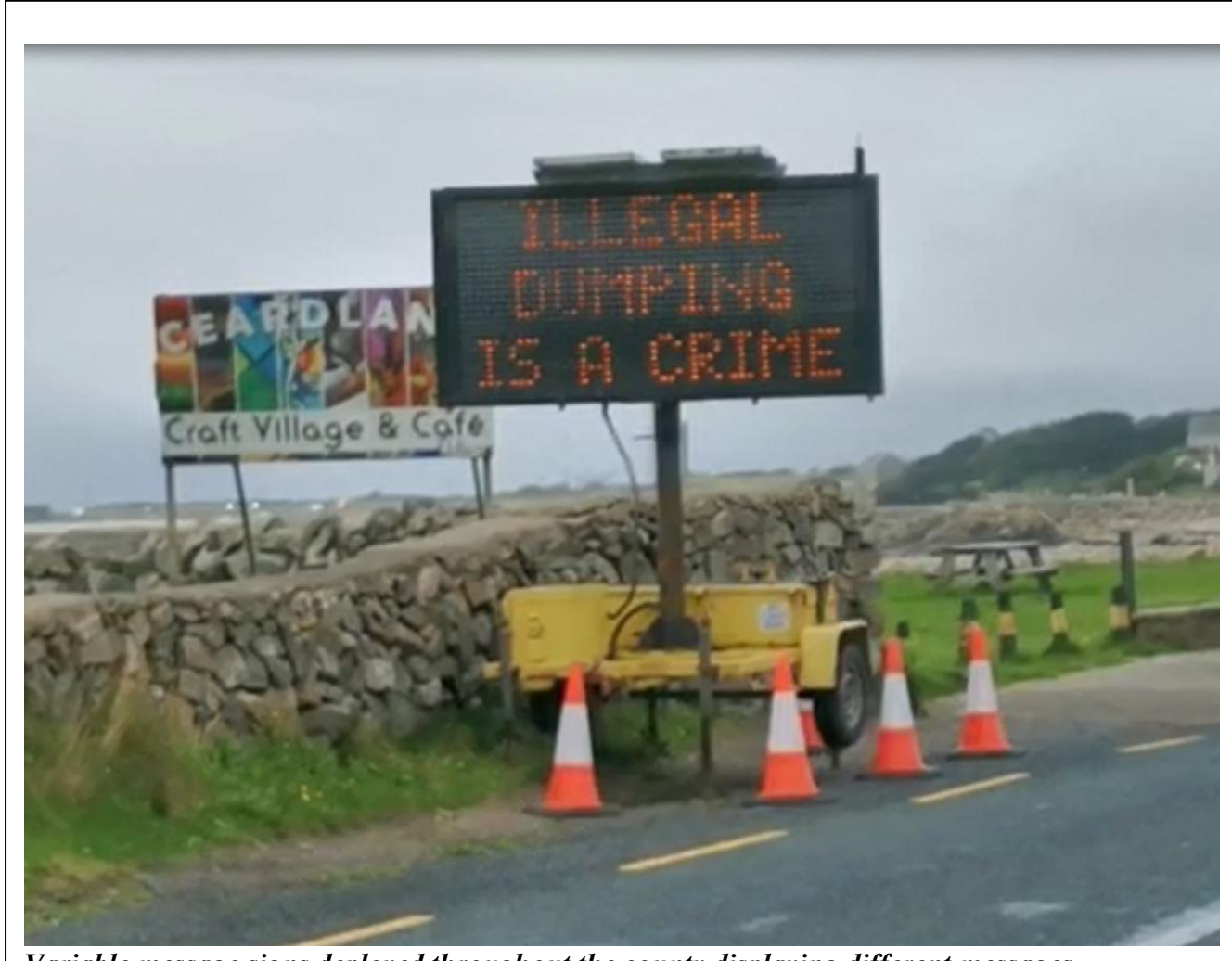
Variable message signs deployed throughout the county displaying different messages