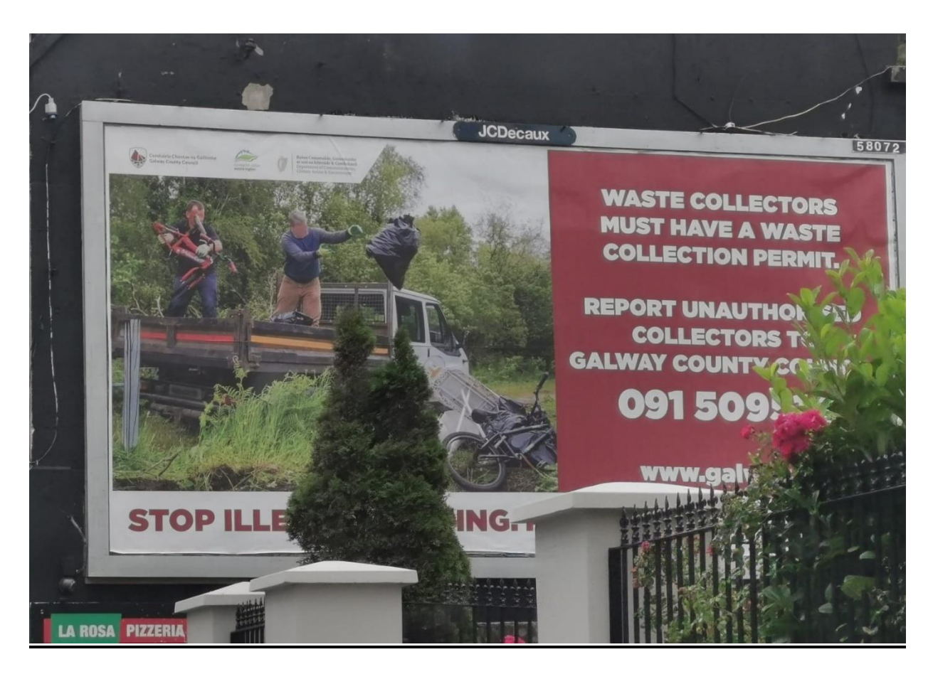
Billboard advertisement on display in Tuam, Co Galway