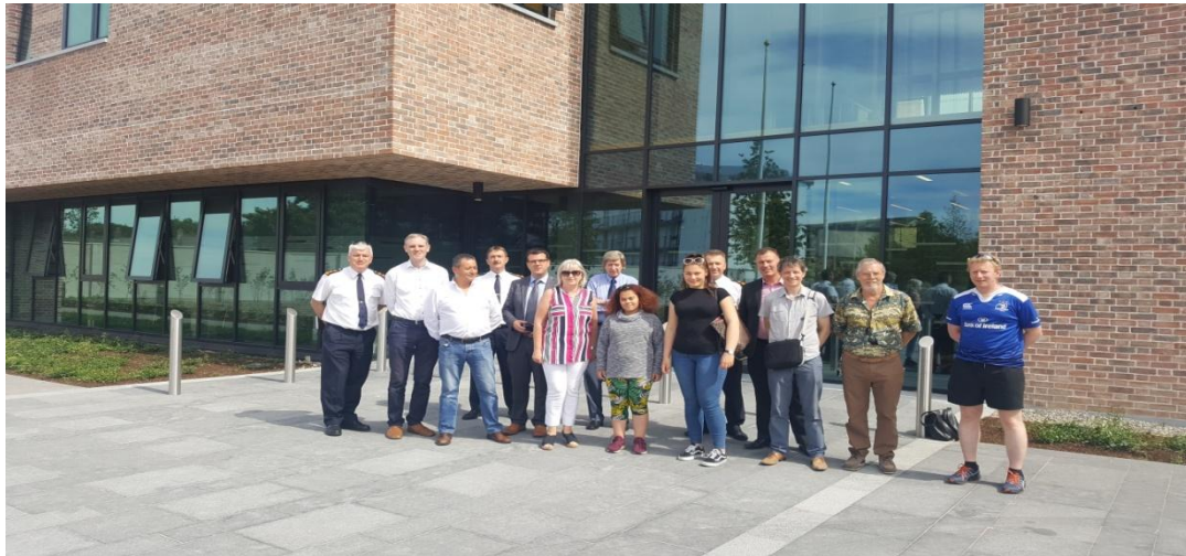
JPC Study trip to Wexford June 2018