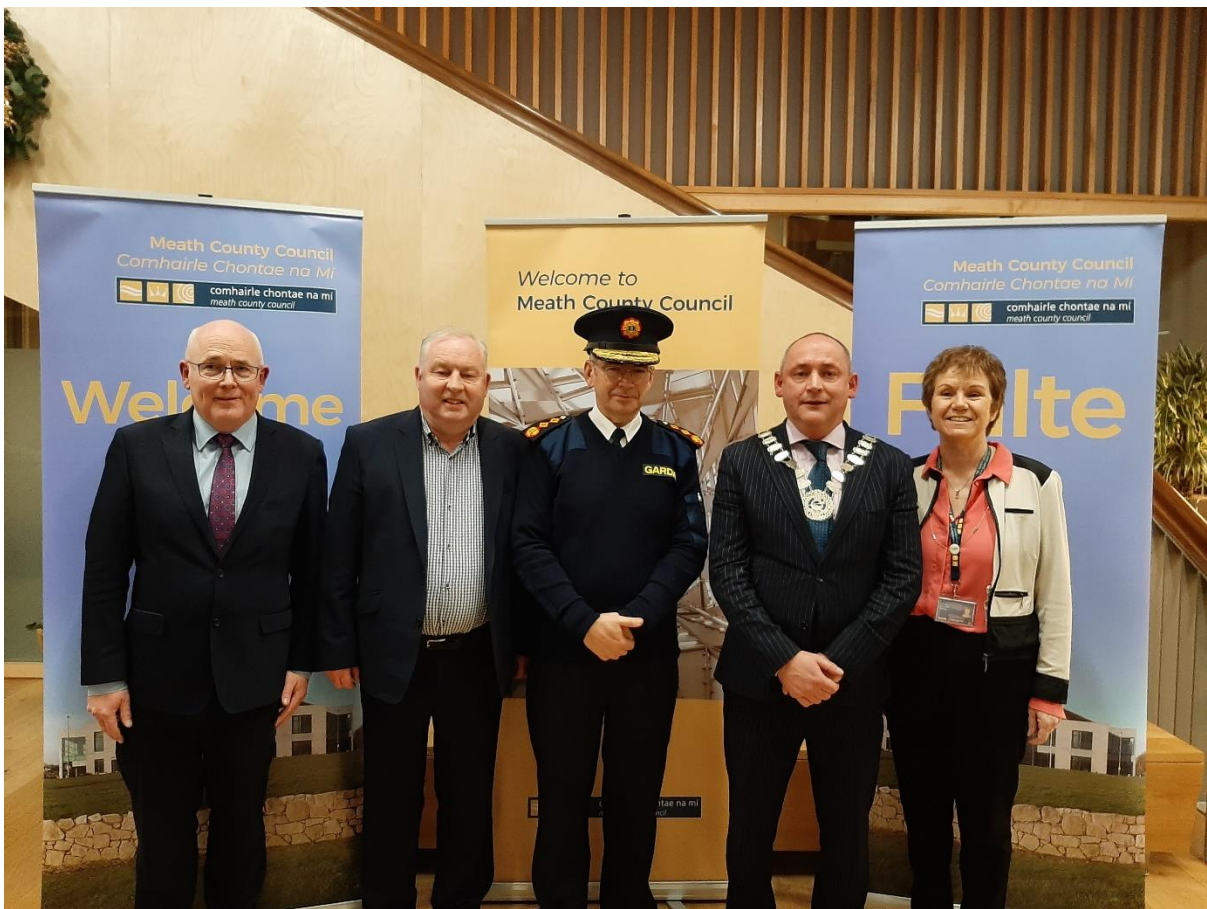
Commissioner Harris visit to JPC Meeting in December 2019