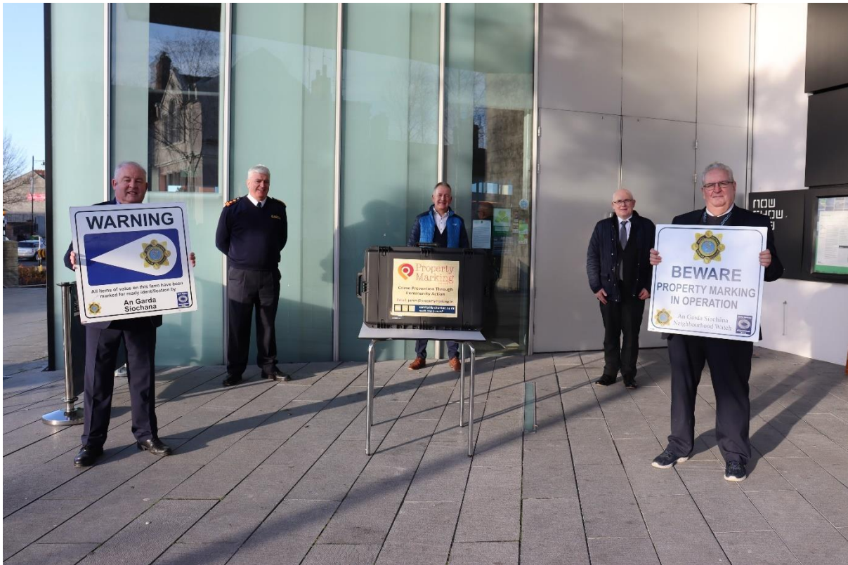
Arrival of Property Marking Machine to JPC Meeting in December 2020