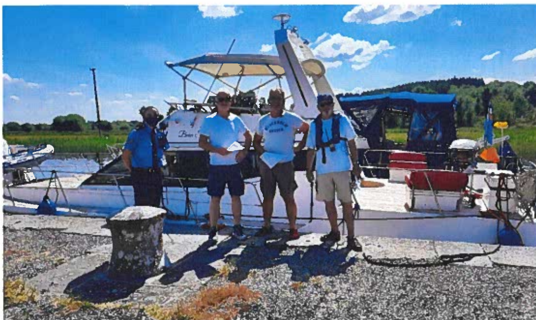
Castlerea Community Poling delivering Boat Security advises at Carnadoe Pier.