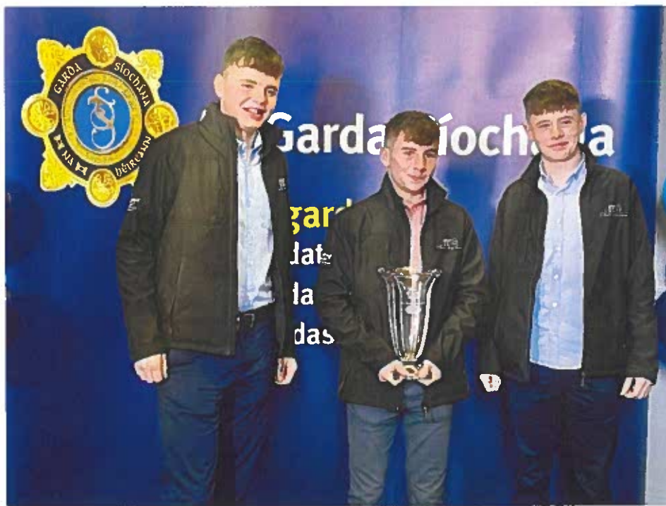
Annual Garda Youth Awards